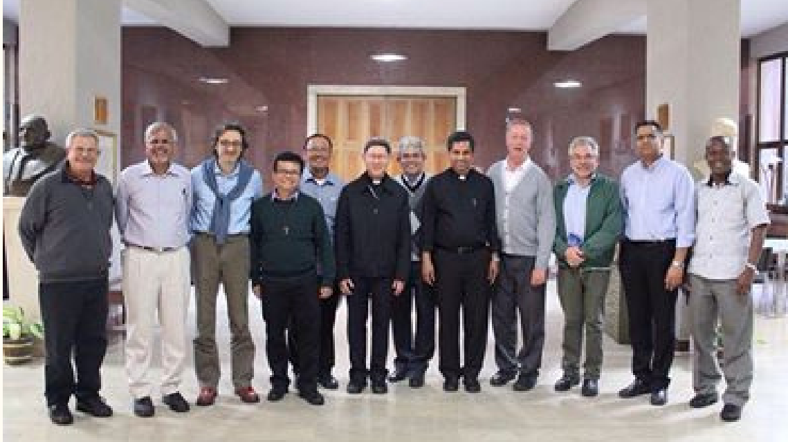
IACM members in Rome with his Eminence Luis Cardinal Tagle during the first meeting.

The members of IACM in Europe have gathered several times to discuss the prevailing concerns in the region. The first meeting was on 8 May 2018 with a group discussion on the topic: “Locating the European Missions in a Wounded World in Deep Transformation.” The discussions were focused on the Church’s response to the different crises confronting Europe and society at large.