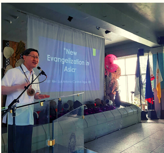
Luis Antonio Cardinal Tagle delivering his Keynote Address

In the spirit of the IACM leadership on a continental level, a greater emphasis is made on animating the local Church with its missionary commitment to a “delicate work of developing an inculturated theology, carried out with courage, in faithfulness to the Church’s tradition and in full ecclesial communion (Ecclesia in Asia 22, IACM Art. II).