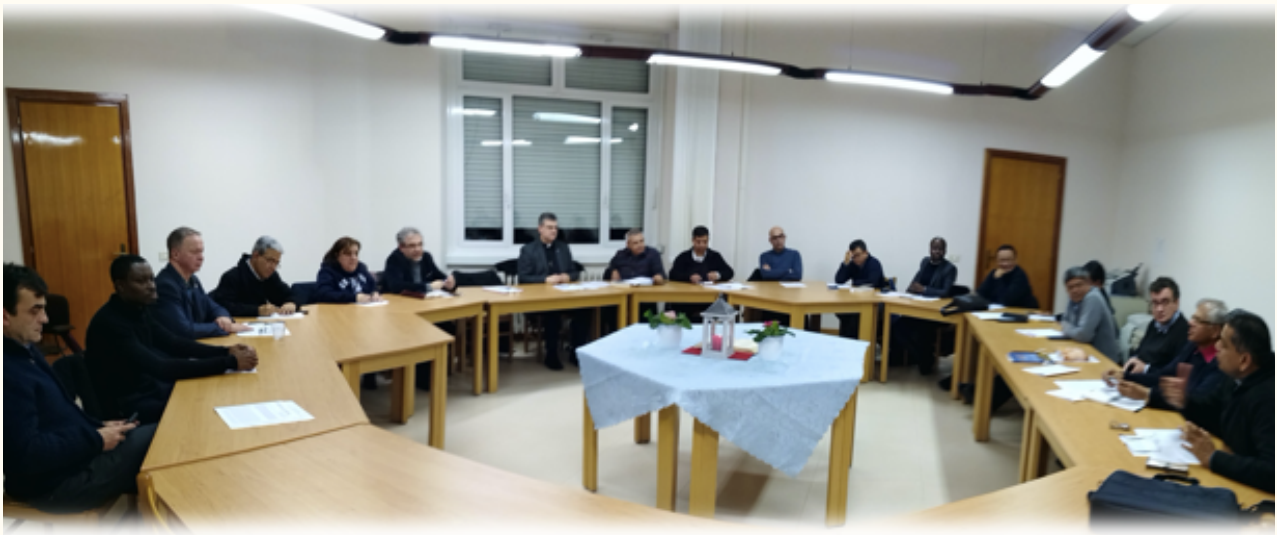
The members gathered at the Casa Generalizia of the Divine Word Missionaries

Two years after on May 18, 2021, the last meeting was held highlighting the theme: “Mission in Covid and Post-Covid Times.” The pandemic caught everyone off guard. So, when Europe was in a state of recovery, the IACM members, together with students and professors of the Faculty of Missiology gathered once again to embrace the new normal. The online conference was one of the unique ways of the pandemic of continuing to reflect on the varied ways the Church can serve the missions.