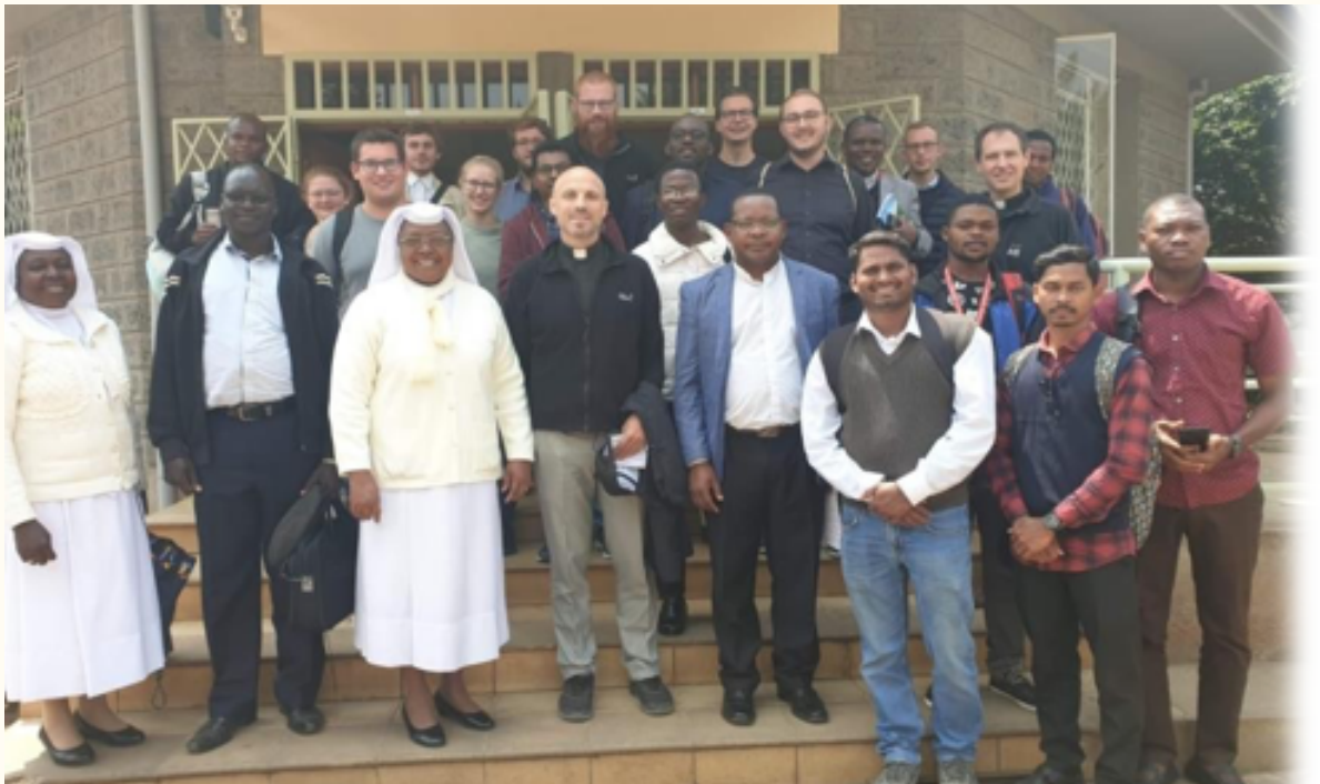
The students of Tangaza University College, Karen-Kenya and Students of Institute of Weltkirche und Mission during the meeting together with IACM members.

To sum up, the subject of this synod is Synodality: For a synodal Church, communion, participation, and mission, are turning points in the history of the Roman Catholic Church in the 21st century. It is an advent in the Church that is neither alien to the Church nor does it contradict her mission. In fact, the synodality launched by Pope Francis fits well with the expression of Karl Barth in 1947 “ Ecclesia semper reformanda est ” (The Church needs always to be reformed) which was also adopted by the Dogmatic Constitution on the Church (LG, 8).